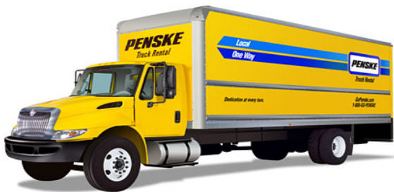
Probably no, but does the GVW exceed 26,000 lbs.?