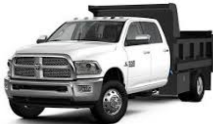
No, unless in combination.