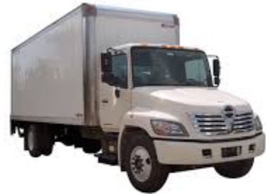
Probably not – look at GVW