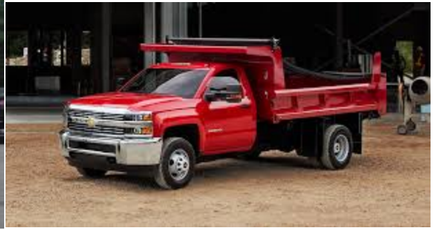
Probably no, unless it qualifies under a combination.