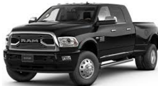
No, unless possibly in combination. Look at the specs.