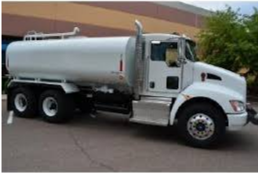
Yes – weight and three axles.