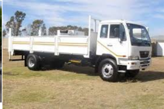
No, unless possibly used in combination.