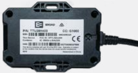
EROAD Asset Tracker