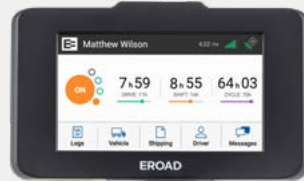
EROAD in-cab device