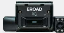
EROAD Clarity Dashcam